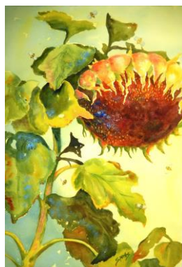
"Very Busy Bees"