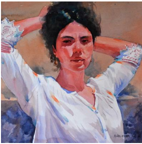
"Putting Up Her Hair"