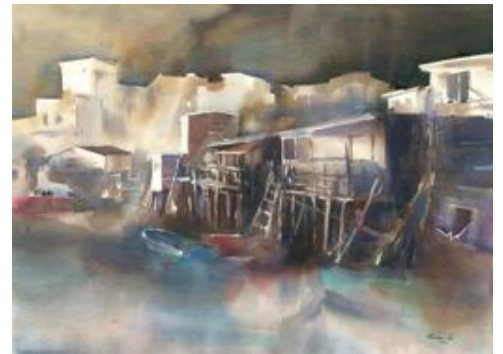
Rainbow Tse Hong Kong, China Water Village 2 22" x 30" $4,000