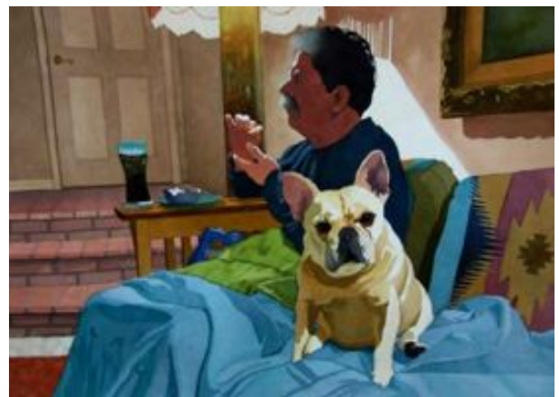
R. Nichols Riverside, California Family Photo 2 15" x 21" $3,000