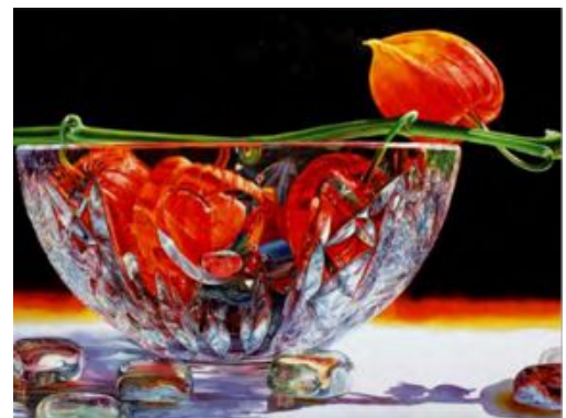
Soon Y. Warren Fort Worth, Texas Hearts in Heart 22" x 30" $6,000