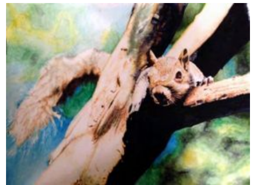
Robbie Fitzpatrick Magnolia, Texas Colorado Squirrel 18" x 24" $3,600