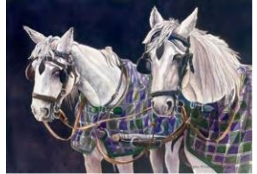
Jane Stoddard East Amherst, New York Buddies 18' x 24" $1,800