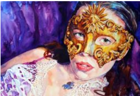
Lance Hunter Tahlequah, Oklahoma Obscured II 20" x 29" $2,900