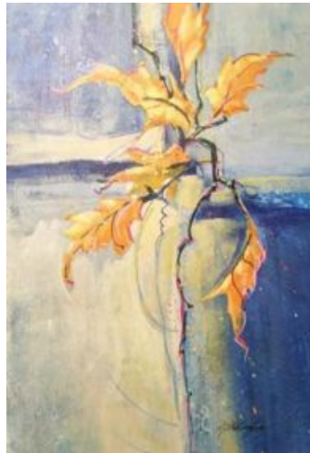
Margie Whittington Fort Worth, Texas Fall Leaves 14" x 22" $400