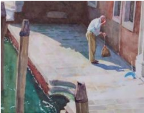
Setsuko Ohara Ottawa, Canada Start of the Day II 15" X 20" $1,000