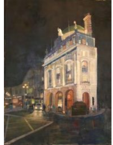
Colleen Erickson Weatherford, Texas Trafalgar London 20" x 30" $2,000