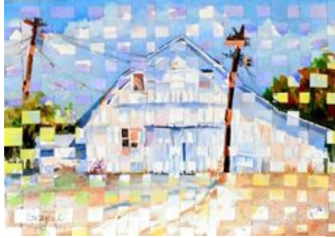
Suzy Powell Plains, Texas Woven Barn 16" x 20" $600