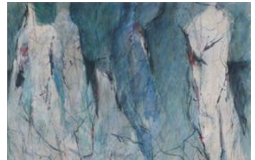
Kathy Elliott Garland, Texas Walking Side by Side 15" x 22" NFS