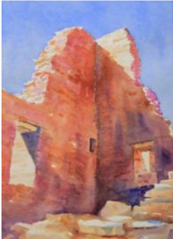
Marsha Reeves Kerrville, Texas Chaco Windows, Shadows, Sky 15" x 21" $500