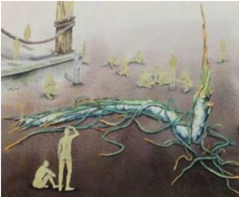
Lone Angilan Shawnee, Kansas Philodendron Awakens 19" x 22" $1,000