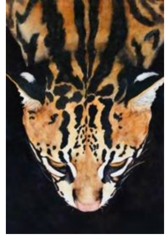
Glenyse Henschel San Ramon, California Ocelot 15" x 22" $875