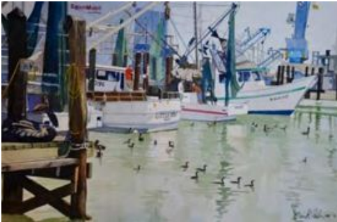
Michael Archer Garland, Texas Waiting for Leftovers 14" x 21" $950