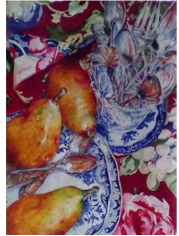
Mollie Jones Flint, Texas Blue Plate Special Pears 22" x 30" $850