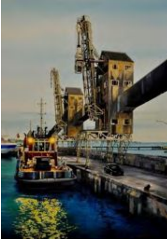
Robert Cook Granbury, Texas Sugar Towers of Barbados 19" x 29" $2,500