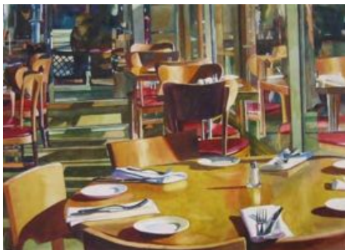
Michael Tang Los Angeles, California NYC: Morning Light 22" x 30" $3,500