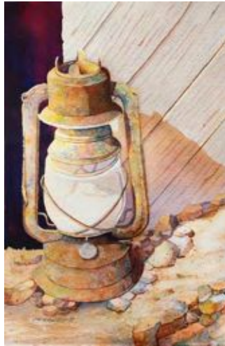
Adela McGrew Keller, Texas Lantern 15" x 22" $600