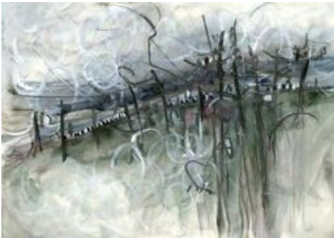
Christine Alfery Lac du Flambeau, Wisconsin Fairies on the Fence 11" x 14" $1,800