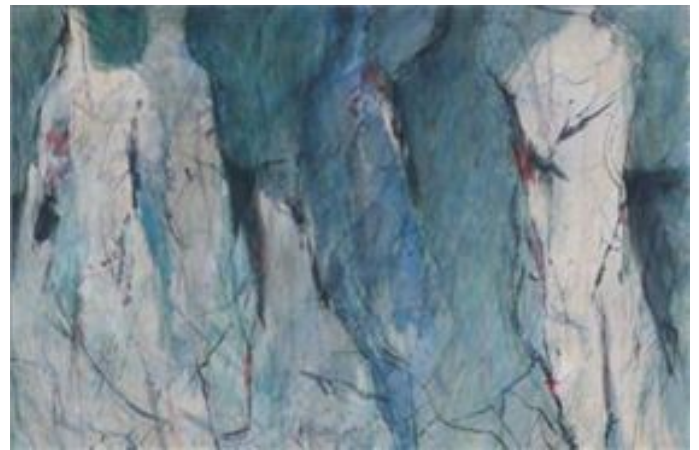
Kathy Elliott Garland, Texas Walking Side by Side 15" x 22" NFS