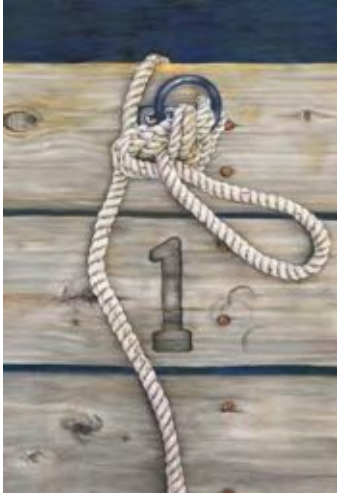
Alisa Shea Northport, New York Tied Up 14" x 20" $2,650