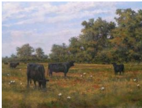
James Stewart Granbury, Texas Afternoon Intruder 16" x 20" $1,000