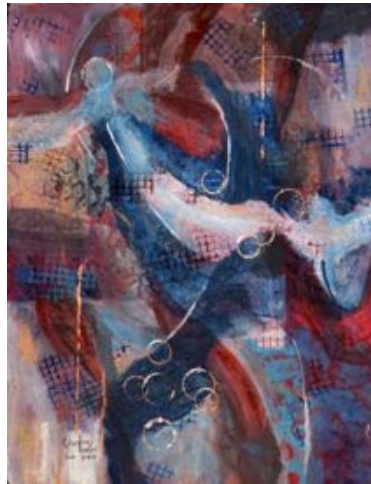
Charlene Baker Fort Worth, Texas A Peek at Infinity 19" x 25" $600