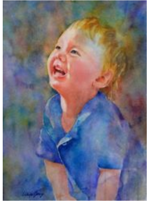
Elaine Jary Bedford, Texas A. Cash 10" x 14" NFS