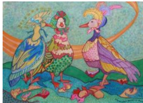
Charlotte Huntley Lafayette, California Quack Chat 22" x 30" $2,000