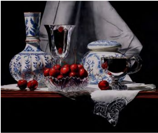
Laurin McCracken Fort Worth, Texas Cherries, Silver & Chinese Porcelain 20" x 24" $6,500