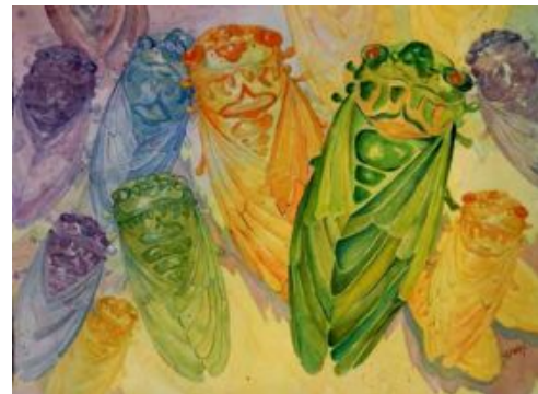
Suzanne McNeill-Sparks Arlington, Texas Crop of Cicadas 22" x 30" $1,200