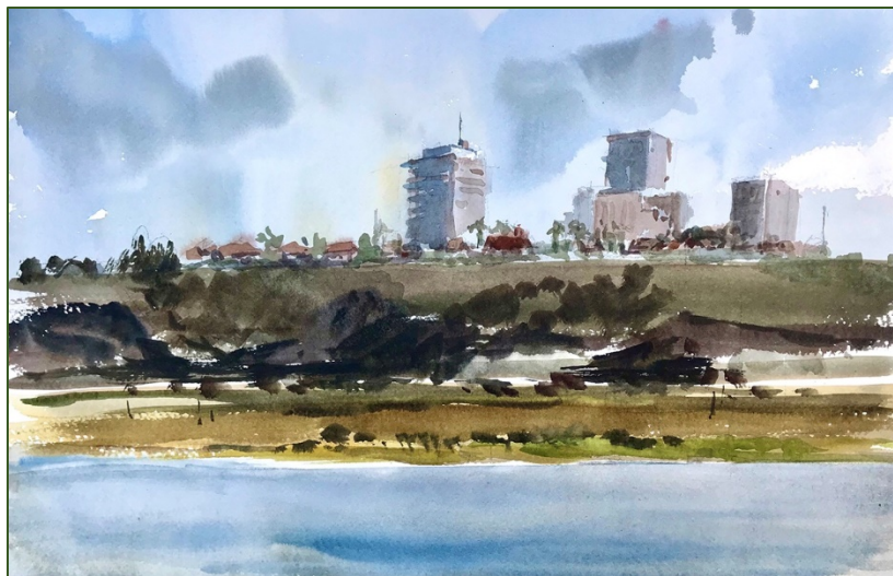
Jai Kim 's painting Back Bay Newport Beach (left) has been accepted into the San Diego Watercolor Society Plein Air Exhibition.