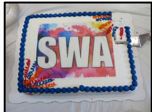
And a big cake to celebrate our 40 th Anniversary!