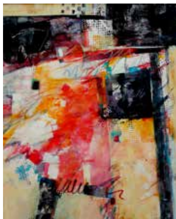
Lynne Buchanan, Arlington, TX Park Avenue 20 x 15 - $350