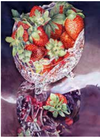
Celeste McCall, Southlake, TX Strawberry Reflections 16 x 12 - $550