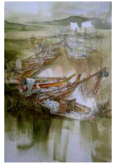
Choon Seng Yeoh, Sungai Petani, Malaysia Accumulate 3 22 x 14.5 - $1,200