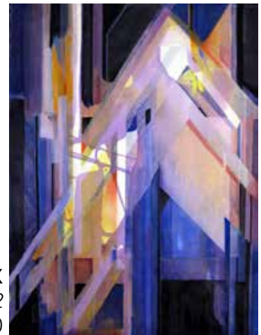
Nancy Maas, Fort Worth, TX Cathedral 2 30 x 22 - $900