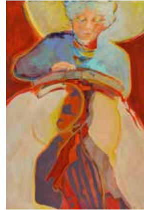
Marilyn Bourbon, Coppell, TX Quilter 22.5 x 15 - $900