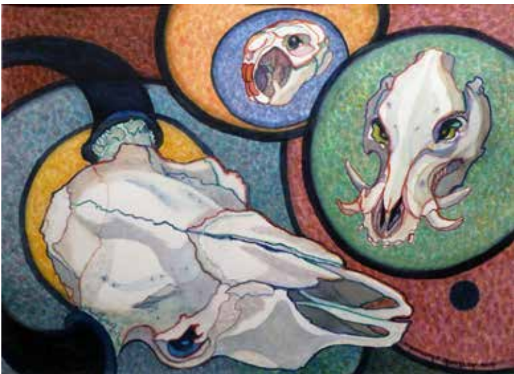
Fourth Place Award Charlotte Huntley, Lafayette, CA The Deadheads 22 x 30 - $2,500