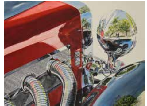
Carolyn Seely, Malakoff, TX Reflections of an Artist 22 x 30 - $2,000