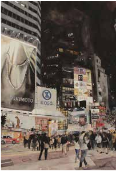
Kwan Yuen Tam, Singapore Advertising Paradise 22 x 15 - $2,300