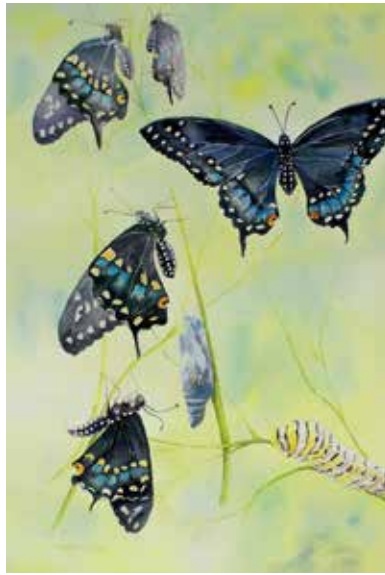
Celene Terry, Enchanted Oaks, TX Swallowtail Story 22 x 15 - $400