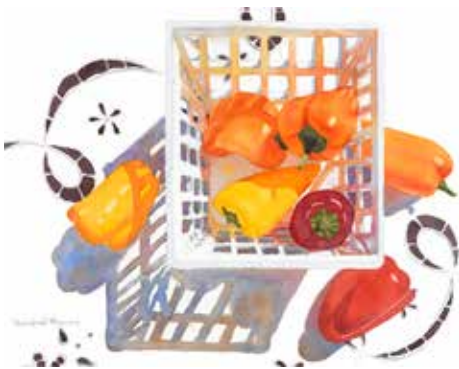
Winifred Breines, Brookline, MA Peppers in White China Basket 19 x 23 - $750