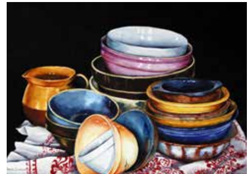
Connie Logan-Levsen, Azle, TX Unity Bowls 22 x 30 - $1,200