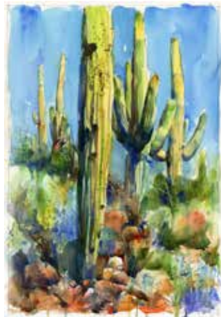
David Lencho, Fayetteville, AR Cave Creek Saguaros 20 x 14 - $2,000