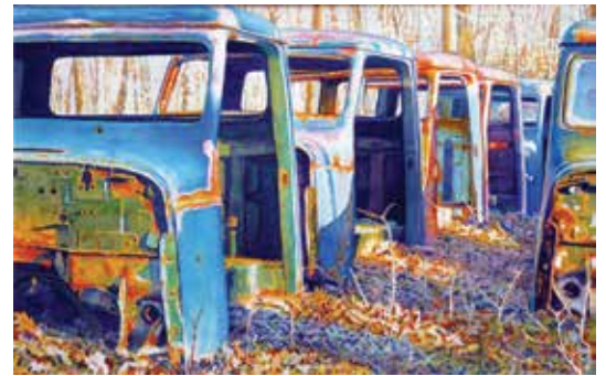
Eileen Neill, Riverwoods, IL The End of the Line 18 x 28 - $2,000