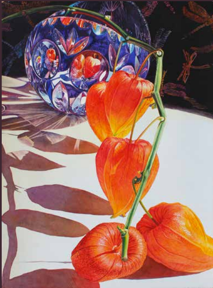
DAVE MAXWELL MEMORIAL BEST OF SHOW AWARD Soon Warren, Fort Worth, TX Chinese Lantern 30 x 22 - $5,000

20 April — 22 June, 2014 Fort Worth Central Library Atrium Gallery