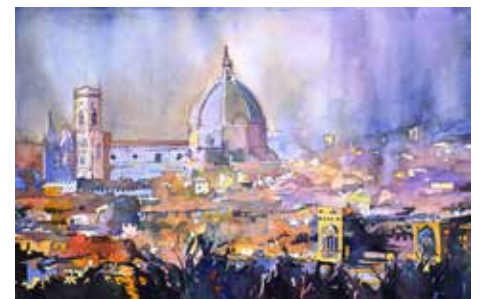
Ryan Fox, Raleigh, NC Florence Duomo 15 x 21 - $900