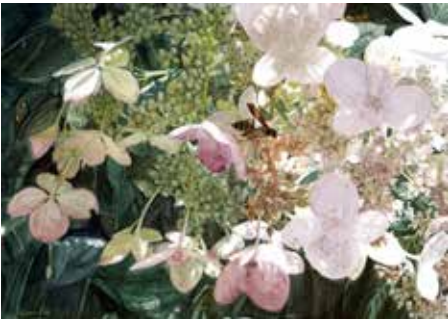
MeeWha Lee, Omro, WI Noon I 7.5 x 10.75 - $1,500