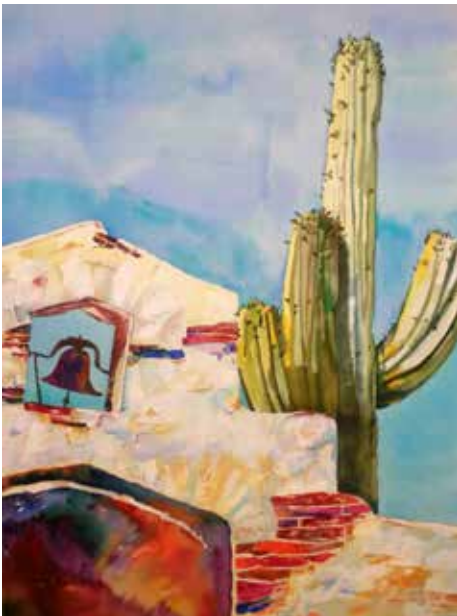
Kay Smith, Big Spring, TX Desert Icons 30 x 22 - $900