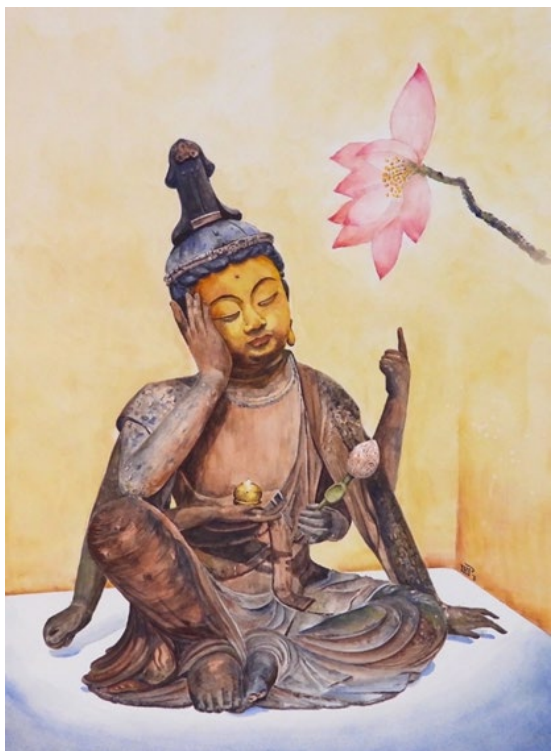
Iok-Hou Pang's painting Cogito won 2 nd place in watercolor in the 2022 Grand Prairie Juried Art Show.