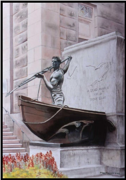
Whaleman Statue, New Bedford