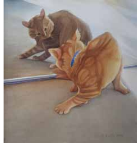
Genie Even, Knoxville, TN En Garde 19 x 18 – $900