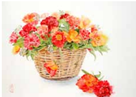
Iok-Hou Pang, Grand Prairie, TX Floral Basket 22 x 28 — $400