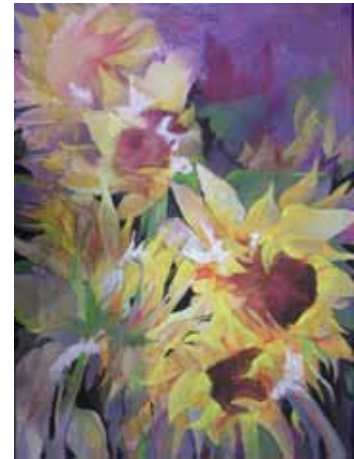
Pam Fritz, Granbury, TX Sun Lovers 22 x 15 – $300