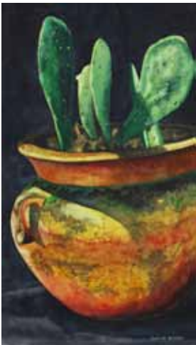
Connie Levensen, Azle, TX Cactus in Clay 30 x 20 — $450