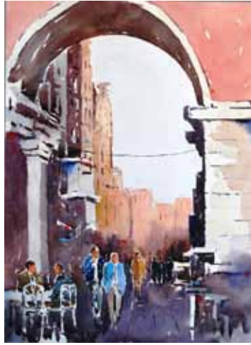
Jim Evans, Arlington, TX Near the Plaza Mayor 20 x 16 – $995