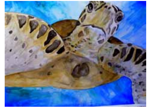
Cheryl Sterling, Flower Mound, TX Are You Looking at Me? 35 x 27 — $1,500