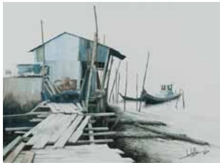
Bee Tat Lim, Selangor, Malaysia Fishing Village No. 17 – Lao Gang 32 x 40 – $5,800