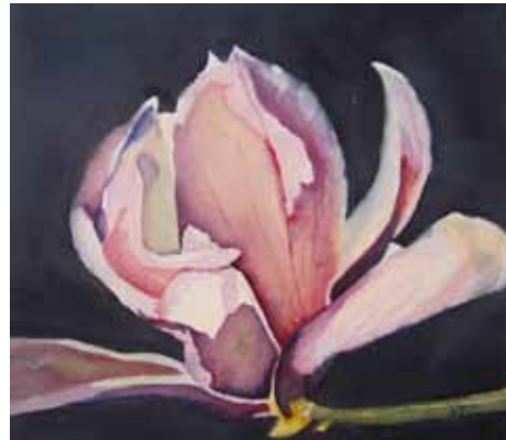
Norma Fitzwater, Malakoff, TX Pink Magnolia 20 x 23 – $460