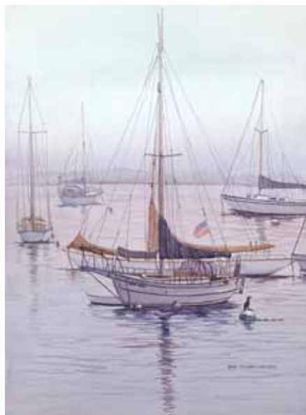
Jane Stoddard, East Amherst, NY