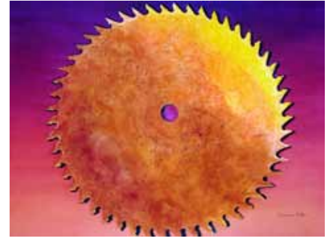
Eleanor Baker, Mansfield, TN Sawblade Sunset 27 x 35 – $1,200