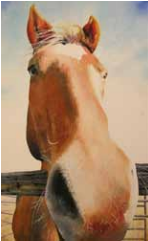
Randy Meador, Ft. Worth, TX Nosey 39 x 27 — $800