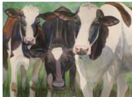
Colleen Dillon, Arlington, TX Curious Ladies 17 x 21 – $300