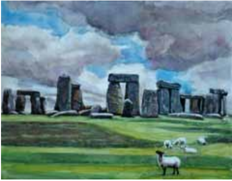
Betty Shelton, Laguna Niguel, CA Stonehenge, England 16 x 18 — $900