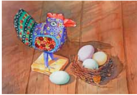
Muriel Mimura, Dallas, TX Which Came First? 21 x 27 — $650