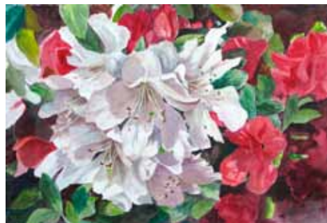
Norma Lively, Euless, TX Azaleas 28 x 30 — $700