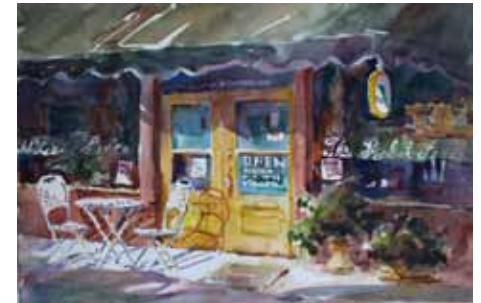
Nel Dorn Byrd, Plano, TX The Picket Fence 21 x 28 – $850