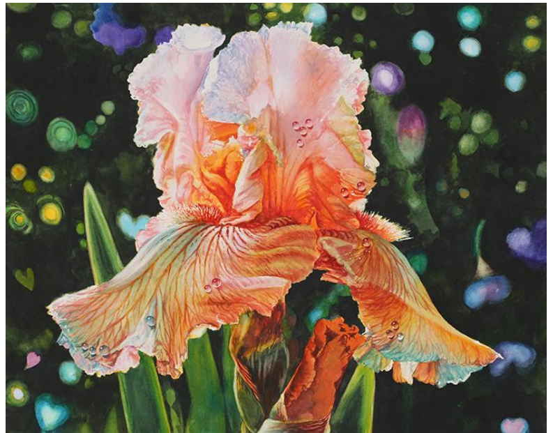
Yes, this is a painting not a photograph!