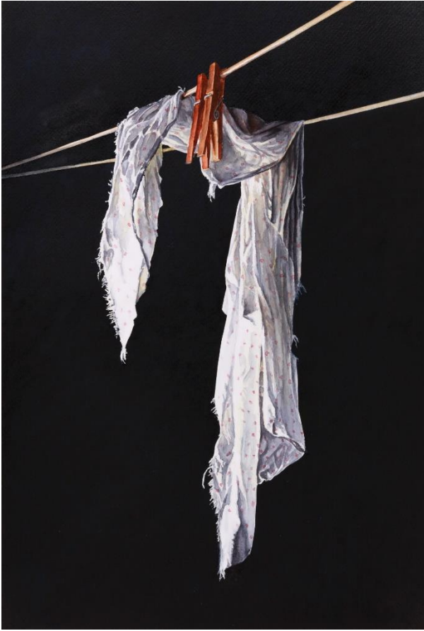
Kentucky Watercolor Society, KWS, Aqueous 2020 - Cloth on the Line – Royal Langnickel and International Artists Magazine Award