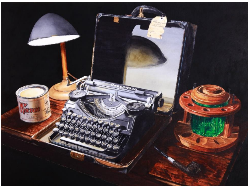
Allied Artists of America – multi-media competition - accepted - Faulkner's Typewriter