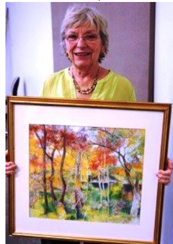
2 nd Place: Bonnie Dunn "Japanese Garden"