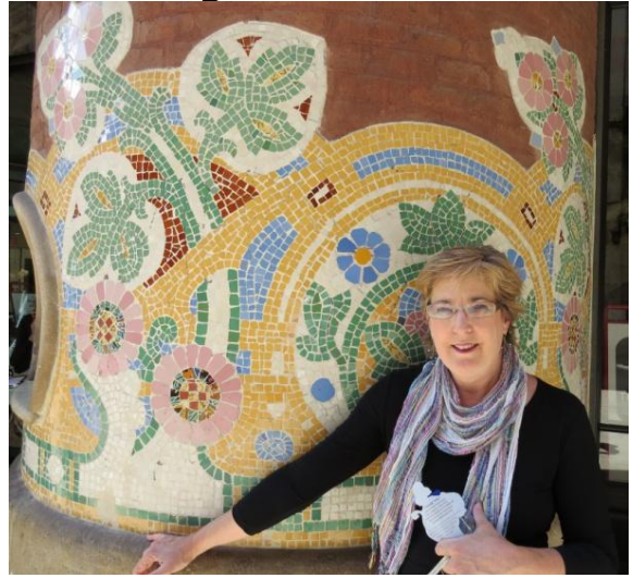
I love mosaics. This is me at the Barcelona Palace of Music