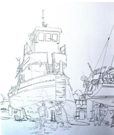
Step One: Transfer drawing to watercolor paper

1. Draw your subject on a piece of paper. Then use a sheet of graphite to transfer your drawing onto your paper, illustration board, etc. Next you paint the whole area of the painting surface with your prepared rubber cement mixture. Make sure BOTH surfaces are completely dry. To lay the frisket film on the painting surface, pick up the mat board, turn it over film-side down, and bend the board so that the center of the frisket touches the center of the area you want to cover, and lay it down. Rub all over the back of the matt board. This will stick the film to the surface over your drawing. As you pick up one corner of the matt board at a time remove the masking tape from the matt board and discard it. Now you have the clear frisket all over the drawing. Burnish, or press down, the frisket with a paper towel wrapped around your finger. If you get a bunch of wrinkles all over it, don't worry. Use a hair drier and blow all the areas with wrinkles and the film will shrink tight as you are burnishing down again. You are now ready to cut out the areas you want to paint first ie; the sky, foreground, windows, doors etc.