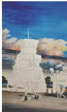
Step Two: Use a razor to cut through the film