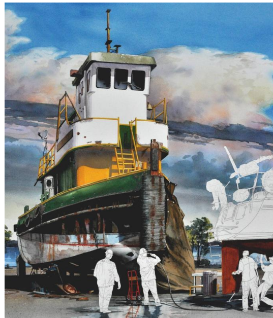
Step 3: Cut around the hull leaving people and upper ship covered Step 4: Remove frisket and paint the upper boat

4. Remove the frisket from the upper tug boat area and the sailboat bottom. Paint those areas using parts of the frisket to do the windows and yellow painted area. Be careful to leave the pure white of the paper clean for the upper boat areas.